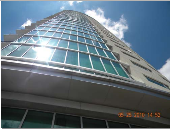
29 Story Condominium: Atlanta, GA