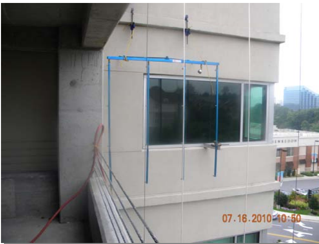
ASTM E1105: Testing of window & façade.